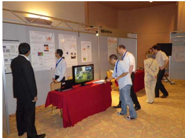
The OMEGA demonstration stand at the Summit